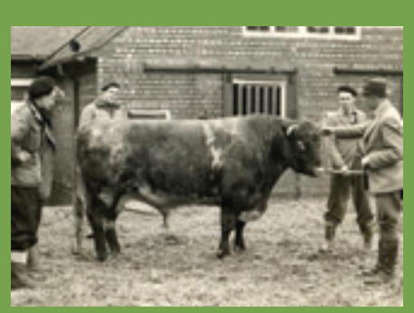
2. Taking the bull by the horns (1950)