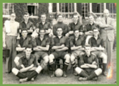
1. Brackenhurst football champs 1949/50

Do these photographs bring back memories of great times at Brackenhurst? We would love to hear your stories and see photographs from your time here. Please send them into us using the pre-paid envelope provided. We promise to return all photographs and booklets.