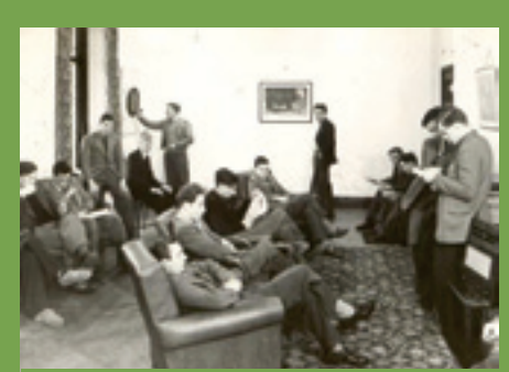
3. Brackenhurst Common Room 1950: It's not all work, work, work...