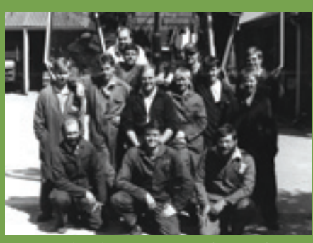
5. Agricultural Engineering students strike a pose (circa 1989)