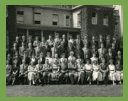
Class of 1956/57

Brackenhurst graduates from 1956/57 are organising their 50th anniversary reunion for Sunday 17 September 2006. If you know the whereabouts of any Brackenhurst graduates