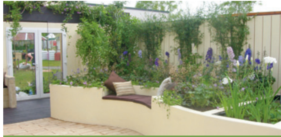
A section of the award-winning gardens

The BBC Gardeners' World Live 2006 brought more success for Brackenhurst students... and a chance to chat with gardening guru Alan Titchmarsh.