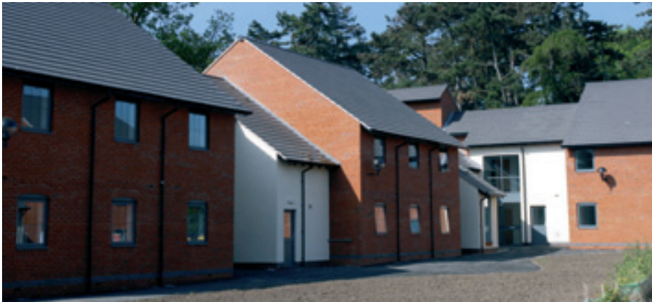
The new halls of residence

The old greenhouse has been replaced with a Dutch-designed unit which provides a highly precise, controlled internal environment. Each of the five internal zones is linked to a