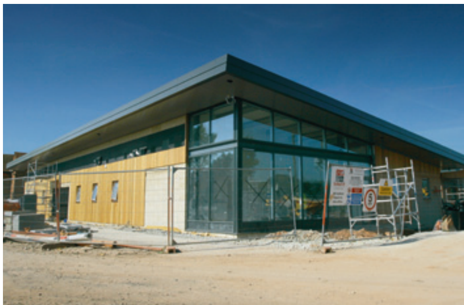
Work on the new veterinary nursing building is now underway

This is exciting new territory for Brackenhurst and features collaboration with the Veterinary Medicine team at the University of Nottingham as well as veterinary practices throughout the East Midlands.