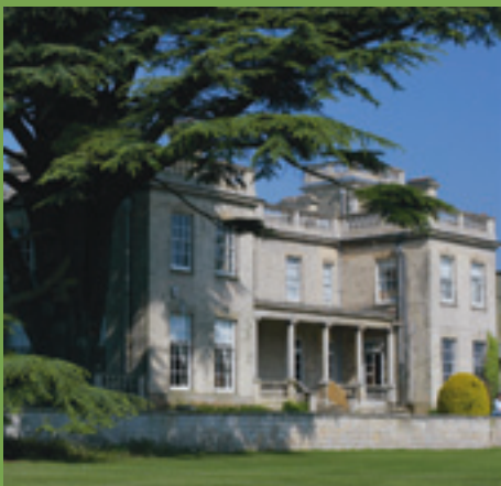
Brackenhurst Main Hall