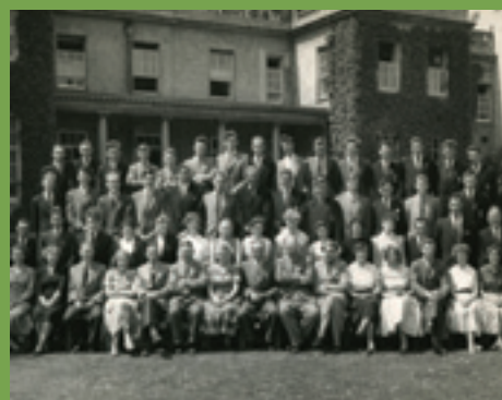
Class of 1956/57

Brackenhurst graduates from 1956/57 are organising their 50th anniversary reunion for Sunday 17 September 2006. If you know the whereabouts of any Brackenhurst graduates