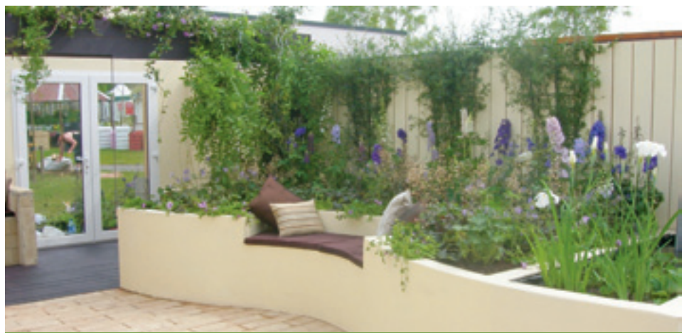
A section of the award-winning gardens

The BBC Gardeners' World Live 2006 brought more success for Brackenhurst students... and a chance to chat with gardening guru Alan Titchmarsh.