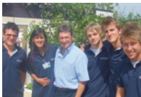
Alan Titchmarsh with Brackenhurst students

The project was generously sponsored by retirement builder McCarthy & Stone and supported by Perennial Gardeners' Royal Benevolent Society.